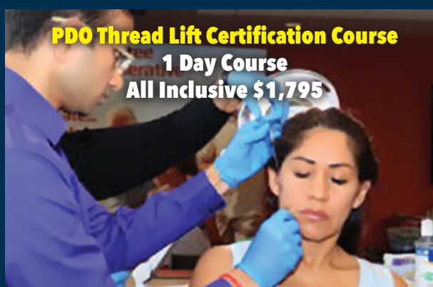
PDO Thread Lift Certification Course 1 Day Course All Inclusive $1,795

August 6-7, 2020 – San Diego CA and Virtual Live Stream August 20-21, 2020 – Nashville TN and Virtual Live Stream