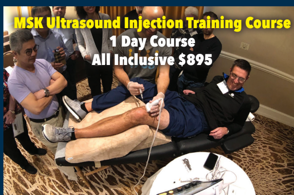
MSK Ultrasound Injection Training Course 1 Day Course All Inclusive $895

August 6, 2020: San Diego, CA August 20, 2020: Nashville, TN