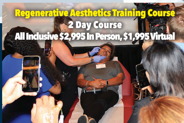
Regenerative Aesthetics Training Course 2 Day Course All Inclusive $2,995 In Person, $1,995 Virtual

August 7-8, 2020: San Diego, CA August 21-22, 2020: Nashville, TN