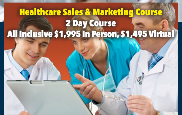
Healthcare Sales & Marketing Course 2 Day Course All Inclusive $1,995 In Person, $1,495 Virtual

August 7-8, 2020: San Diego, CA August 21-22, 2020: Nashville, TN